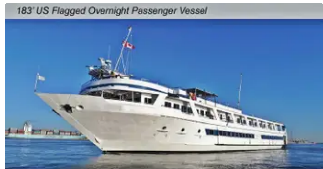
183' US Flagged Overnight Passenger Vessel